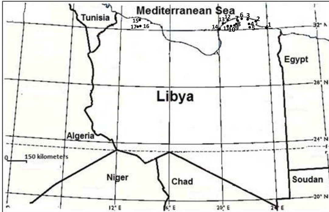
Fig.1. Map showing the sites (old and new) of collections of family Pottiaceae in Libya. 1- Tobruk, 2- Darnah, 3- Chersa, 4- Al Qubba, 5- Mechili, 6-Susa, 7- Shahet, 8- Beida, 9- Wadi Kouf, 10- Tocra, 11- Al Marj, 12- Tecniz, 13- Tolmetta, 14- Benghazi, 15- Tripoli, 16- Borgo and 17- Gharyain.

is covered by arching Plateau built of upper Cretaceous and Tertiary sediments of limestone, subordinate dolomites and marls. These sediments were deposited at the southern margin of the Tethys sea.