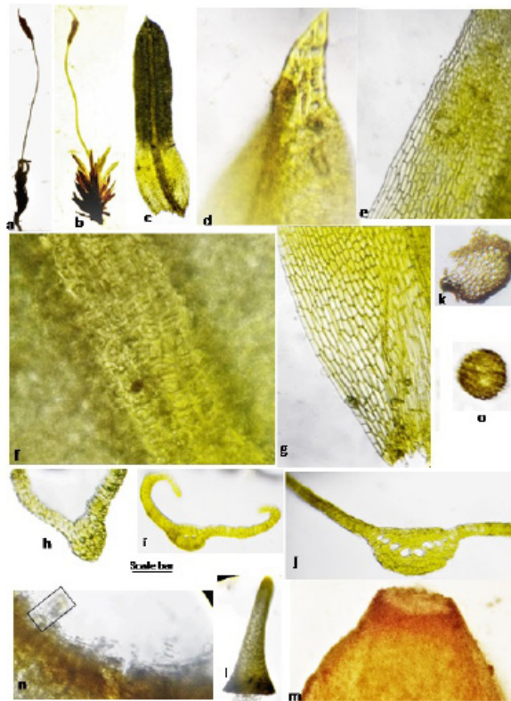
Fig. 4. a-o, Weissia controversa var. crispata : a- Dry gametophyte carrying sporophyte. b- Wet gametophyte carrying sporophyte. c- Leaf. d- Leaf apex. e- Upper marginal cells. f- Ventral surface of costa. g- Cells at leaf base. h,i,j- Different cross sections of a leaf. k- Cross section of a stem. l- Lid. m- Capsule mouth. n- Part of peristome teeth. o- Spore.

becoming larger upward, narrowly long lanceolate to oblong lanceolate, 1.6-1.9 mm long, 0.15-0.3 mm wide, gradually tapering from an oblong base (Fig. 4c); apex acute, short mucronate (Fig. 4d); margins plane, incurved to \pm involute toward apex, entire at base to crenulate-papillose above; costa 36-65 \mu m wide, excurrent, semicircular to \pm flattened in cross section, with ventral and dorsal stereid bands and 2-8 guides, epidermis differentiated ventrally and little differentiated dorsally (Fig. 4h-j), with quadrate papillose cells on upper ventral surface of costa, elongate papillose cells on dorsal surface of costa (Fig. 4f); upper laminal cells quadrate, hexagonal, 6-12 \mu m long, 6 \mu m wide, strongly papillose, evenly thick walled (Fig. 4e); basal laminal cells linear to long rectangular, 24-30 \mu m long, 6-12 \mu m wide, smooth, with thin walls (Fig. 4g). Seta 6 mm long; capsule elliptical, with small mouth, erect, orange-brown, slightly furrowed when dry (Fig. 4m); lid long and narrowed, conical, persistent (Fig. 4l); peristome rudimentary (Fig. 4n). Spore, brown, papillose, 18 \mu m in diameter (Fig. 4o).