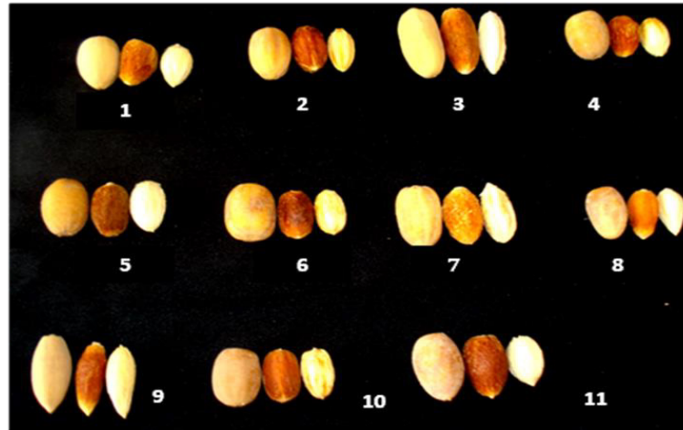
Fig. 1. Morphological differences of fruits and kernels in eleven individuals of B. aegyptiaca