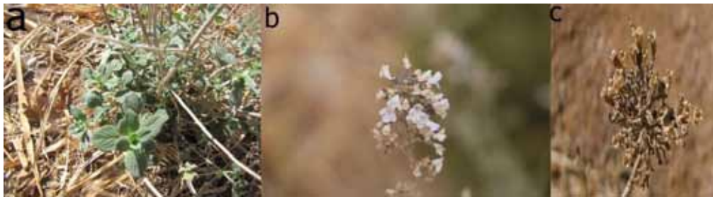
Fig. 2. C. serpyllifolium subsp. barbatum ; a= Leaves, b= Inflorescences and c= Fruit.