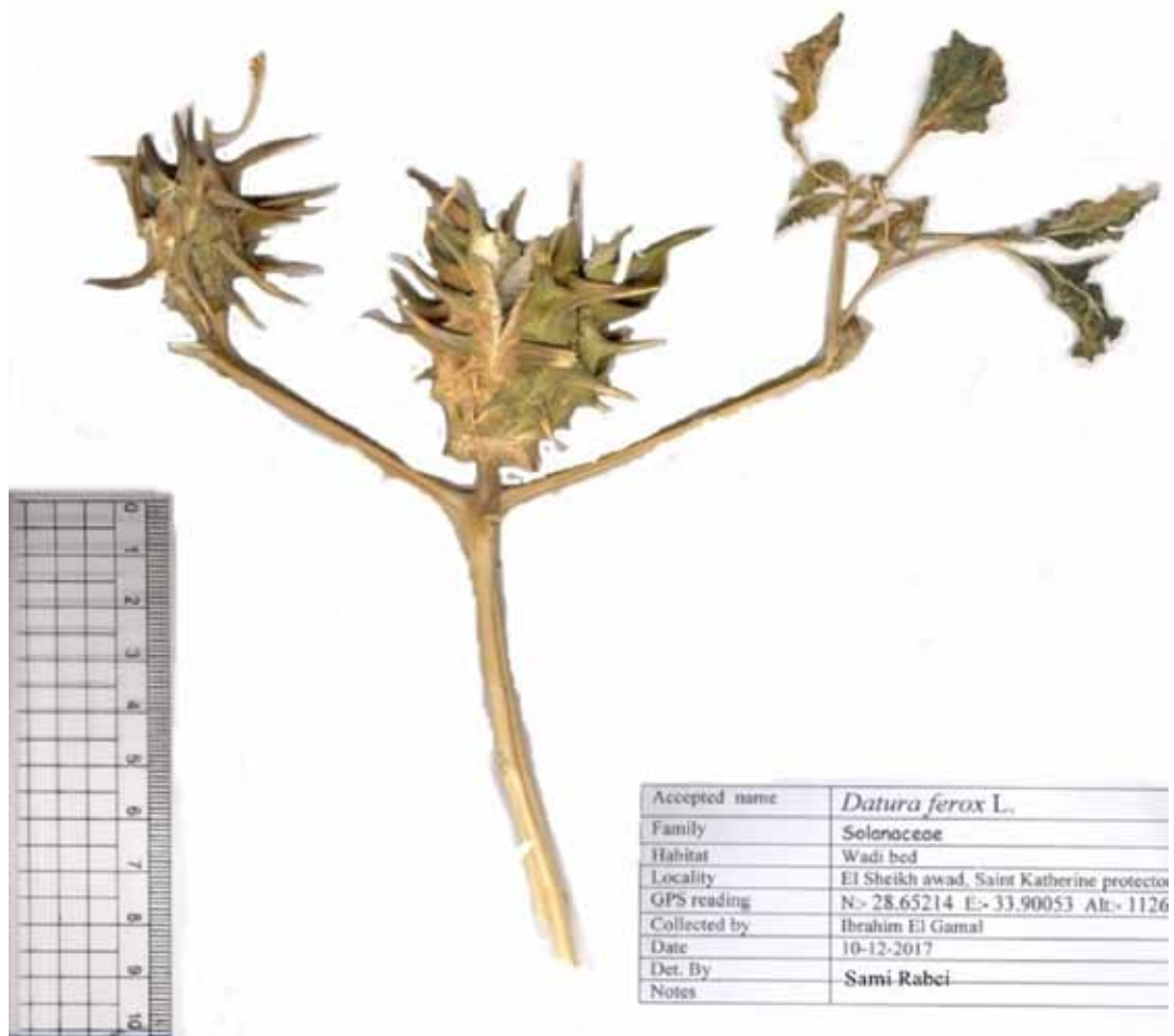
Fig. 4. Datura ferox herbarium specimen.