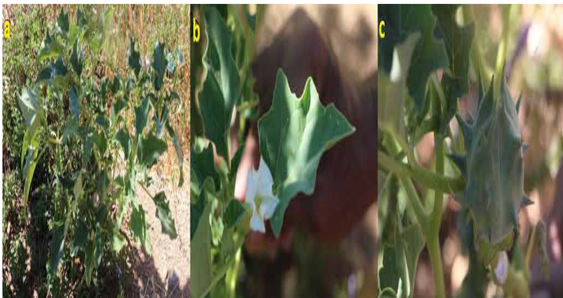
Fig. 5. a= Datura ferox whole plant, b= Flower and c= Fruit.