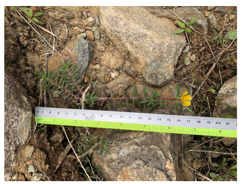
Fig. 1 A. Spreading and flowering P. foliosa in its natural habitat

Habit: perennial, herbaceous, spreading, fleshy succulent, main branches 0.3-0.5cm thick, old branches often woody at the base, stem procumbent coloured when young and colourless when old, up to 30cm long. Leaves: crowded near the tip of the branches, up to 2.5cm long, 0.3-0.5cm wide, green with or without purplish apex when young, purple when old, linear, sessile, alternate, subcylindrical, glaucous, obtuse apex, hairy stipules not conspicuous. Flowers: solitary or cluster, up to 1.5cm in diameter, terminal, brightyellow, showy, bracts whitish with purple tips, involucre leaves present, red or pinkish sepals up to 0.4cm long, free 5 retuse bright-yellow petals up to 1cm in length, numerous yellow stamens up to 14, branched recurved stigma. Fruits: dehiscent ovoid capsule with numerous minute black or dark gray domed-shaped seeds (Fig. 1). A morphological comparison between the newly recorded taxon and the five reported Portulaca spp. in the flora of Saudi Arabia is given in Table