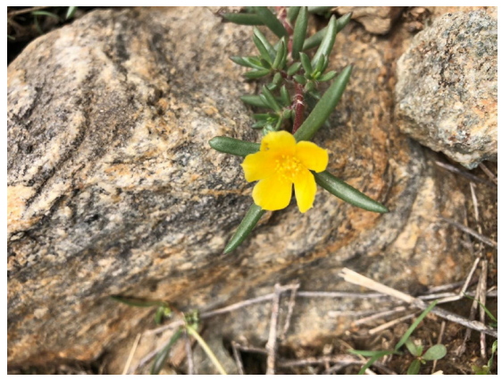
Fig. 1 B. A succulent branch with conspicuous green, glaucous leaves terminated by a solitary opening flower