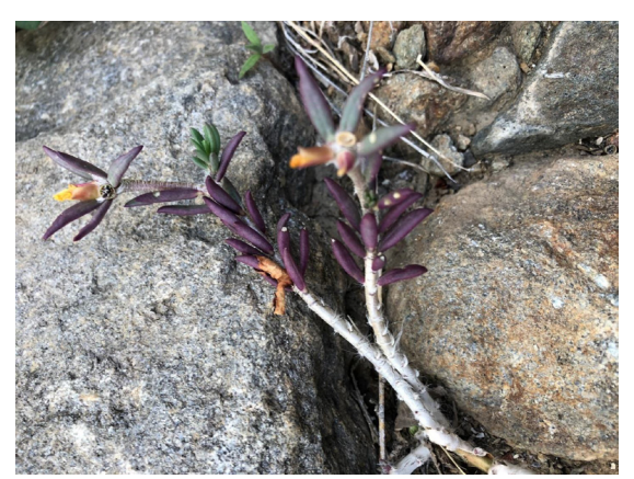
Fig. 1 C. Old colourless stems, purple leaves, and fruit scars