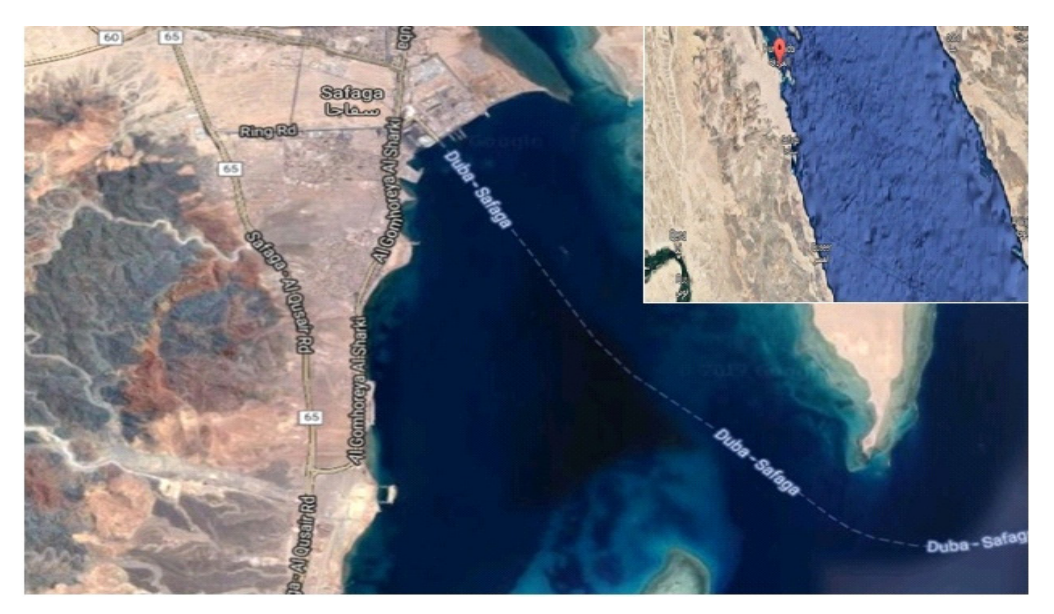
Fig. 1. Safaga location map, Rea Sea, Egypt.

located in the west coastal area of Red Sea shore between longitude 34^{\circ}17 'E and altitude 26^{\circ}06 'N.