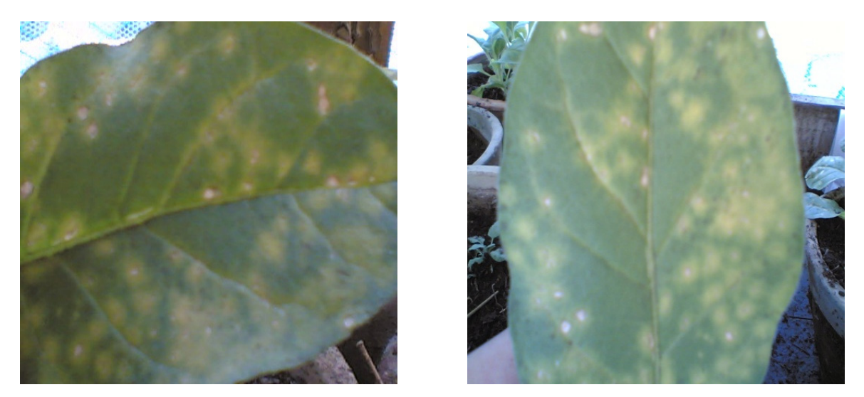
Fig. 2. Chlorotic local lesions formation on Datura metel leaf after inoculation with TMV.

Another observation from the data shown in Table 1 was that; TMV was more affected by the inhibitory activity of chemical compounds than that for TNV for most tested compounds and this may owes to the difference in morphology of each virus; where the rod shaped TMV has a larger surface area subjected to the compounds in comparison with the polyhedral shaped TNV which has compacted and small surface area subjected to the compound.