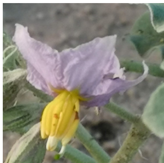
Solanum nigrum L.