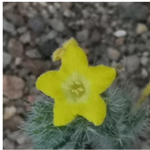
Arnebia hispidissima (Lehm.) A. DC.