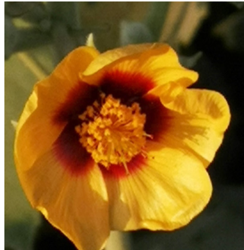
Abutilon pannosum (G.Forst.) Schlttl